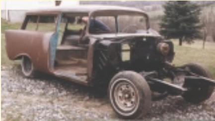
Not much to look at, but full of potential. TP Tools & Equipment provided the HVLP Turbine Paint Spray System for this trophy-winning, 1957 Chevrolet Station Wagon restoration.