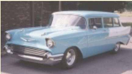
The most critical part of any restoration is the "final finish". After months (or years) working on a vehicle you want a deep, rich, stunning, high-gloss finish. TP Showtime Turbines put these results at your fingertips.